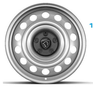
15/16" Steel Wheels